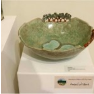
Elaine Biery "Bosque on the Rio,"