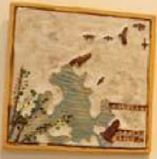
Small text caption below the first artwork.