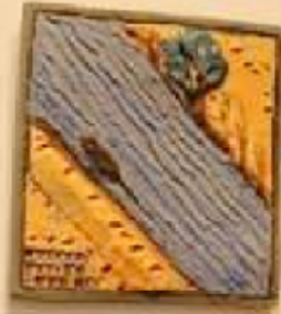
Small text caption below the second artwork.