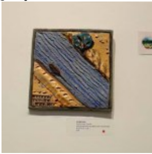
Best of Show Cirrelda Snider "Muskrat Faster Than Me"